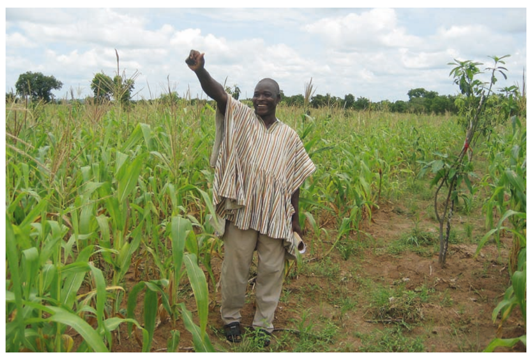
Farmer, Integrated Support Livelihood Activities, Bawku West District, Ghana

results, thereby building interest in the programme. Over the longer term, farmers who were previously inactive during the long dry season can become engaged in economic activities related to livestock breeding and tending productive trees.