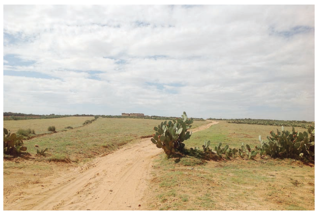
El-Brek, Kasserine, Tunisia, a marginal remote area affected by poverty and drought