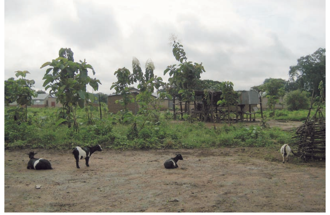
Small ruminants, Borgou Department, Benin