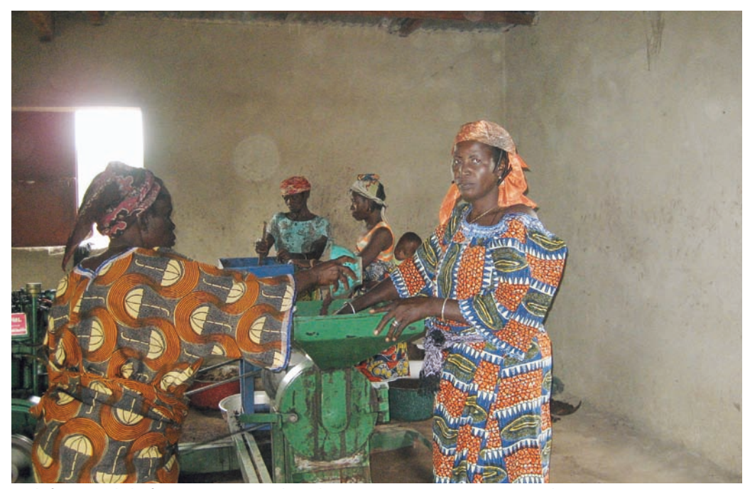
Multifunctional Platform, Women Grinding Shea Butter, Women's Group, Sinendé, Benin

In addition to the activities in Benin discussed in section 2, which focused on integrating environmental issues into developments plans and policies, the Programme to Support Drylands Development Activities in Benin also supported the implementation of community level projects. These included activities to protect soil for productive agricultural use and promote reforestation. The introduction of energy efficient cooking stoves was intended to reduce firewood consumption, which can contribute to deforestation and erosion, by improving