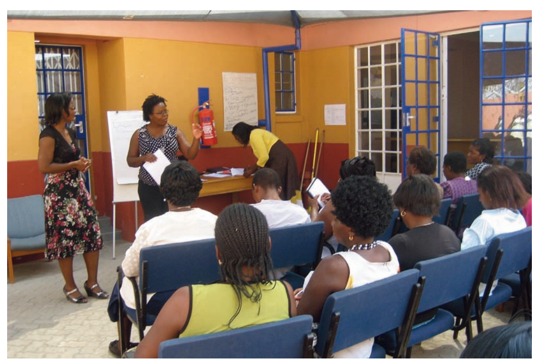
Namibia, meeting in Oshindi District Offices with community members, Ondobe Constituency, Northern Namibia