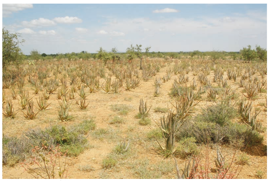
Aloe vera propagation field, Turkana, Kenya.