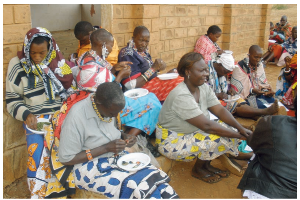
Training of Handicraft Group members, Namanga, Kenya.

During phase one of the MAP (2004-2008)<sup>7</sup> baseline surveys identified major challenges affecting drylands communities, including: poverty, lack of markets and market information, limited public and private sector investments, low levels of business development skills among drylands communities, poor access to financial services, and policies that were not responsive to the marketing challenges facing the poor. Communities surveyed were found to be very enthusiastic about the initiative and dispelled misconceptions that there were no commercially viable products by identifying 34 products readily available for production and processing for sale. The MAP has built the skills, capacities and organization of drylands communities in producing and marketing livestock and livestock products, plant-based products, and honey.