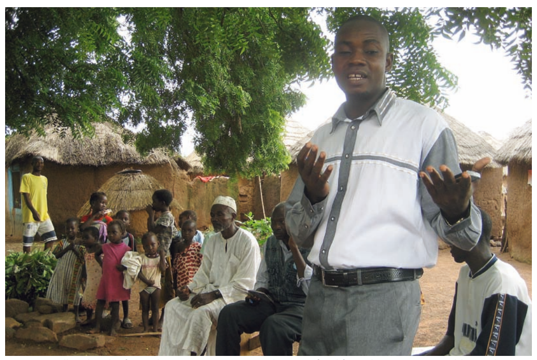
Courtesy call to the Chief, Savelugu -Nanton District, Ghana, Official from the District Assembly speaking