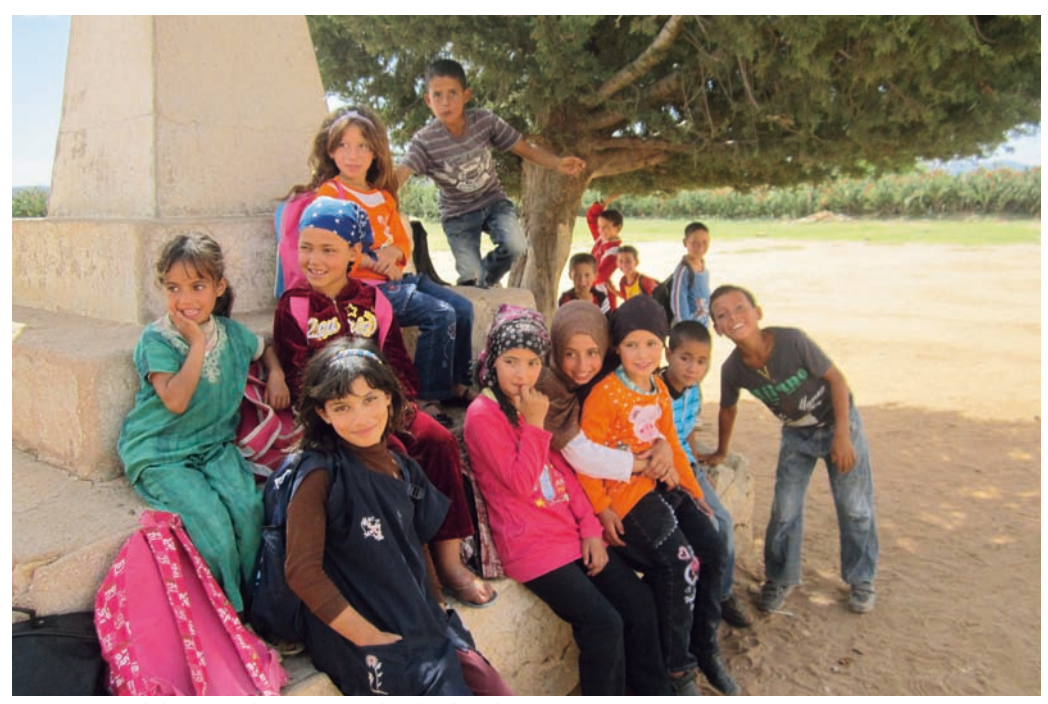
Community children on their way to school - El-Brek district, Kasserine, Tunisia